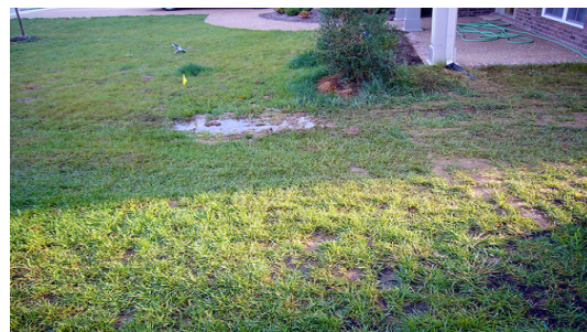
Figure 2 – Negative Drainage