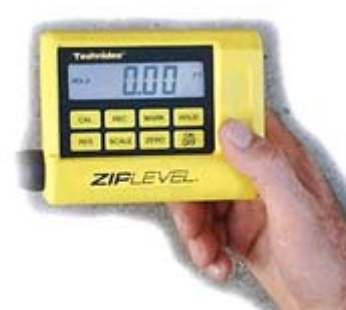
Figure 2 – Stanley CompuLevel